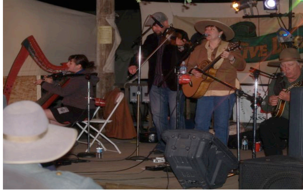
The Cowboy Celtics

The dinners Friday and Saturday evenings were catered and folks got in line early in anticipation of a great meal.