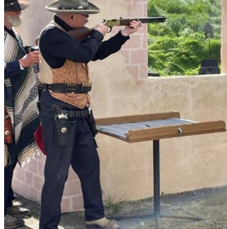
Professor Cubby Bear ( cubbybear29521@aol.com )

(Watch for the Professor's wise words of wisdom here again soon.)