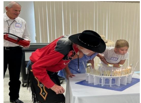
85 candles need help from 2 of his Granddaughters!