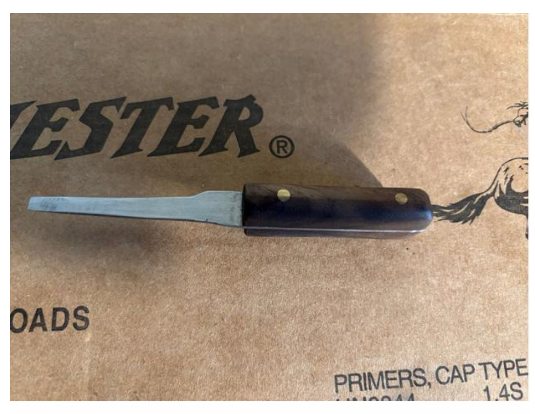
Home crafted screw knife by Fordyce for Leia

Next time you see me at the range I will be happy to show you how to clear these jams. If you like YouTube you can find information in video from there.