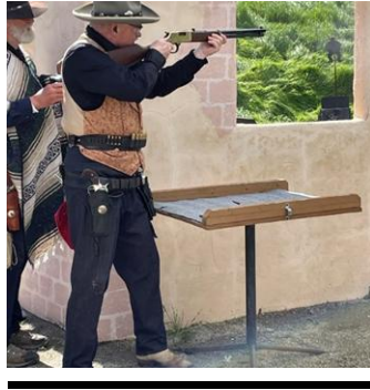
Professor Cubby Bear

(Watch for the Professor's wise words of wisdom here again soon.)