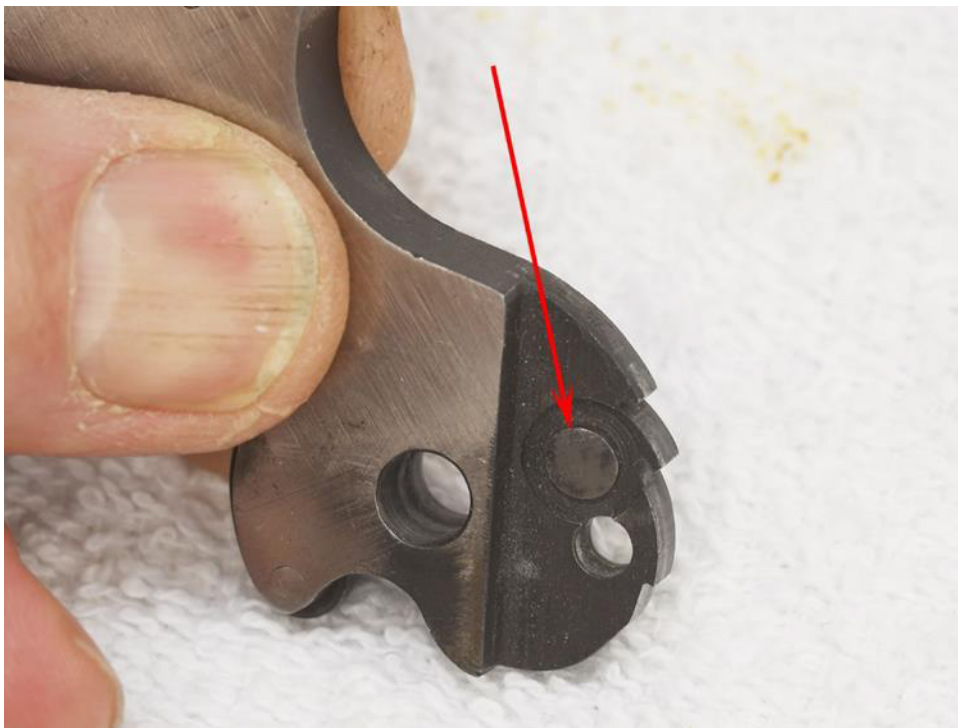
Fig.6 Hammer Cam, smear two drops with hammer back. Grease is OK here if you clean your guns often. Grease does not need to be used anywhere on a single action revolver; however, the hammer cam (Fig.6) is one area that it is OK to use it.