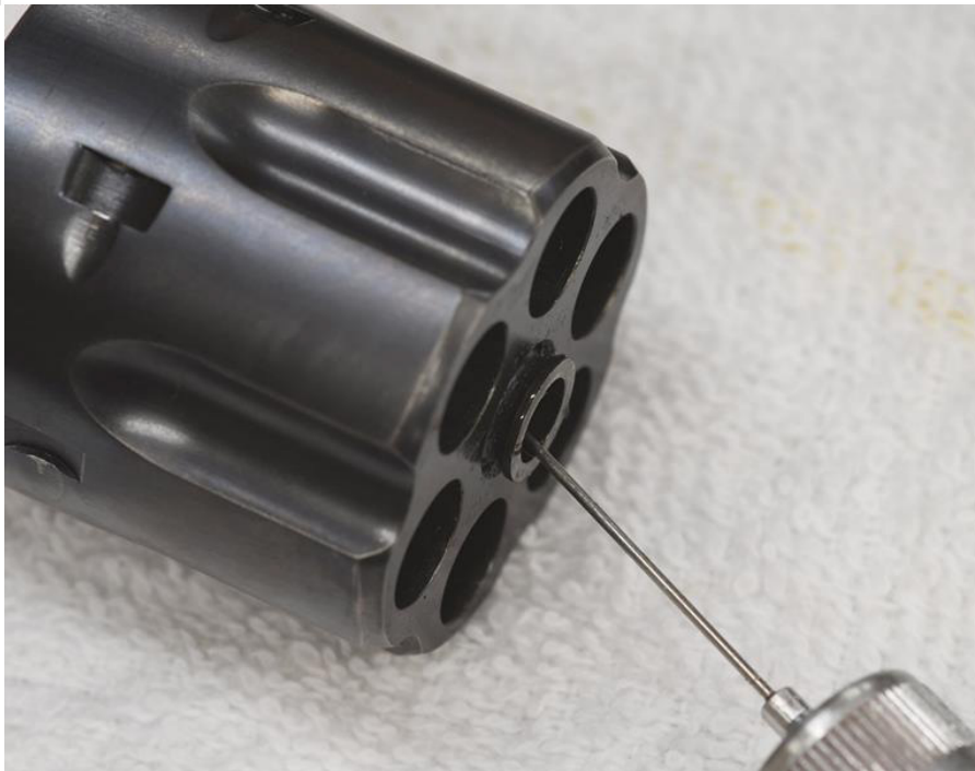
Fig.3 Inside the bushing, 3 drops.