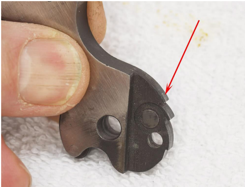
Fig.7 Hammer Shelves/Notches, place two drops and cycle action twice to spread. ( Fig.6 & Fig.7 can be accessed when the hammer is at full cock. Remove the cylinder for safety. )

(I personally don't use this method of discrete lubrication, instead I like Ol' # 4, spray the whole gun and action in Break Free CLP {Cleans Lubricates Protects} Mil-PRF-6346oF Type A, originally developed for the U.S. Military. I wipe off the excess and shoot. In a similar one product does all, Bad Man Bob told me he uses Rem oil to clean and lube.)