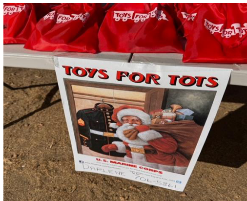
2024 She-Bang Collected Toys and over $1k cash!