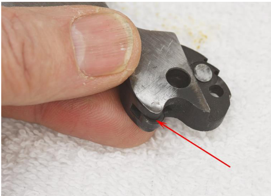
Fig.4 Hammer Roller, one drop each side. The hammer roller is the worst place to put grease, the roller will stop spinning and wear a flat spot that will destroy the roller!