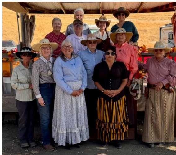
2024 Ladies of Five Dogs