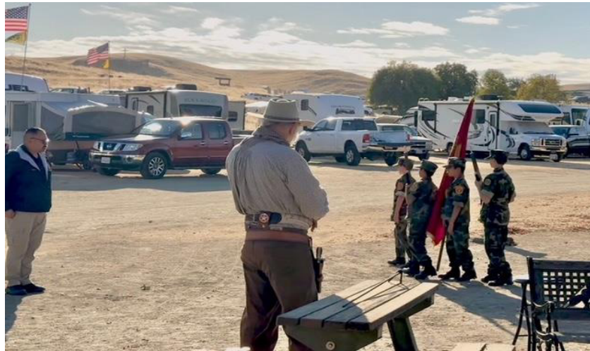
2024 She-Bang Opening Ceremonies with Young Marines Honor Guard