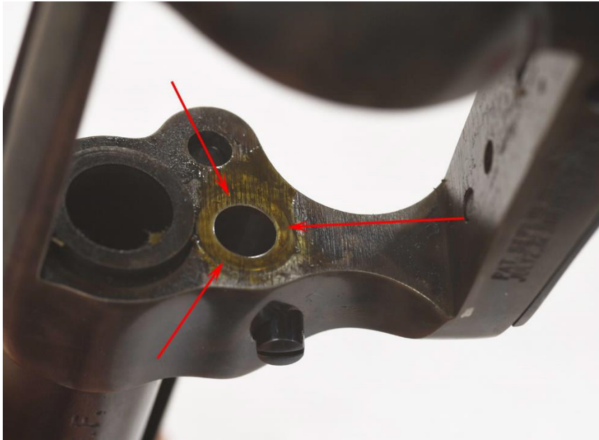
Fig.1 Front bearing surface, smear one drop.