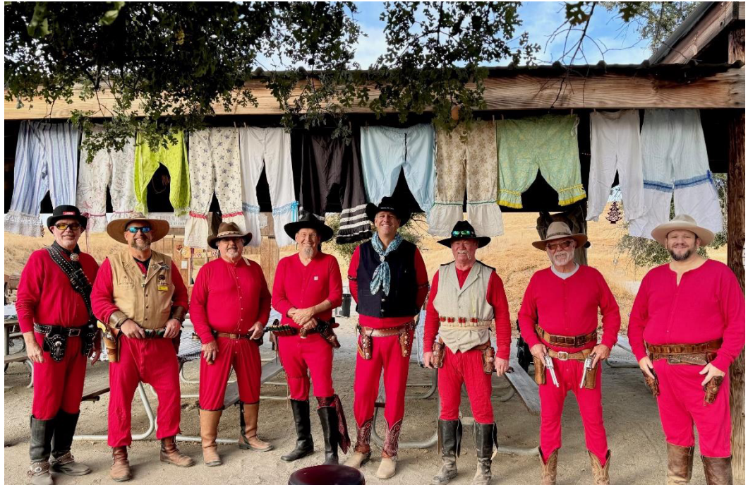
The Union Suit Boys of She-Bang 2024