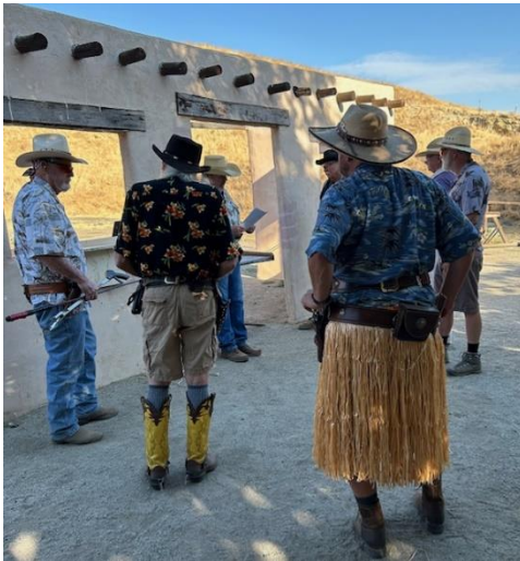
Saturday "Posse Up"