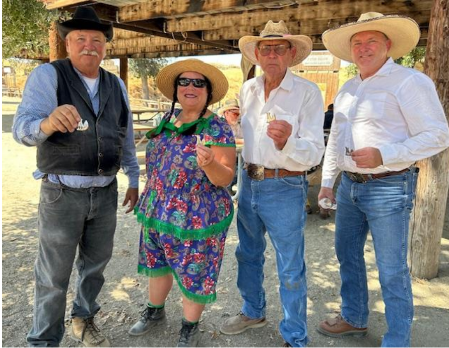
Dead Eye Maverick, No So Dead Eye Maverick, Bad Man Bob, Coyote Carson