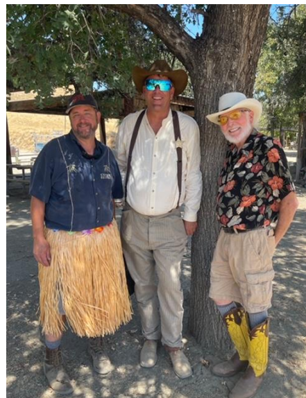
Bull McFearson, Dutch Longhorn, Utah Blaine