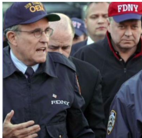
Mayor Giuliani