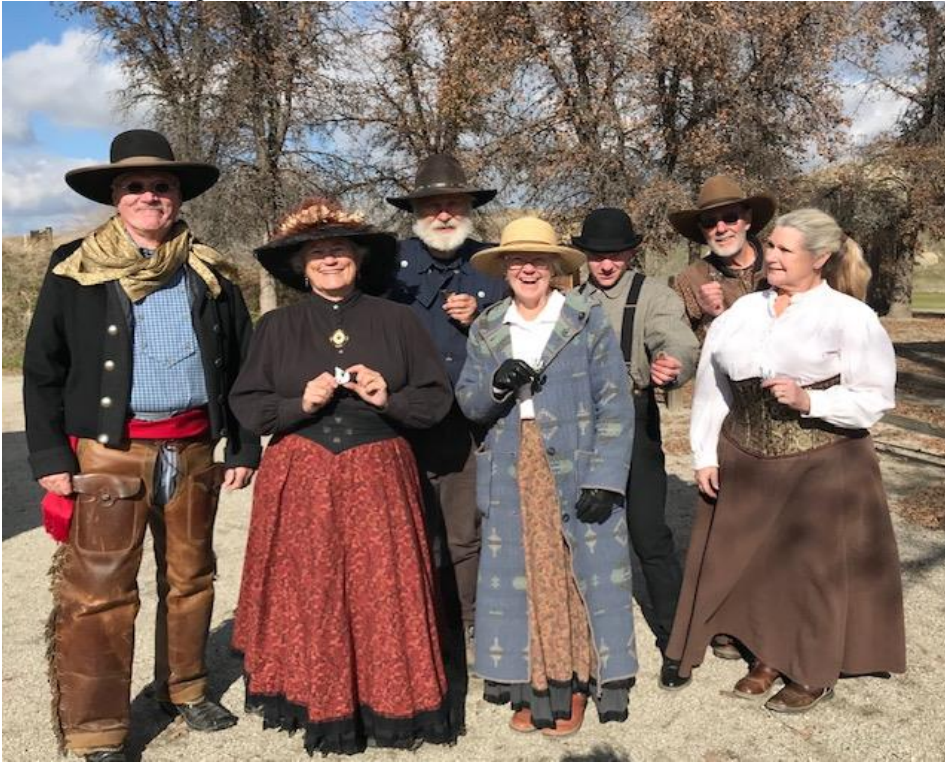
COAL TRAIN, LAP DOG, FORDYCE BEALS, LEIA TOMBSTONE, LUCKY LU, PINEBOX FILLER, DUSTBOWL DEBBIE