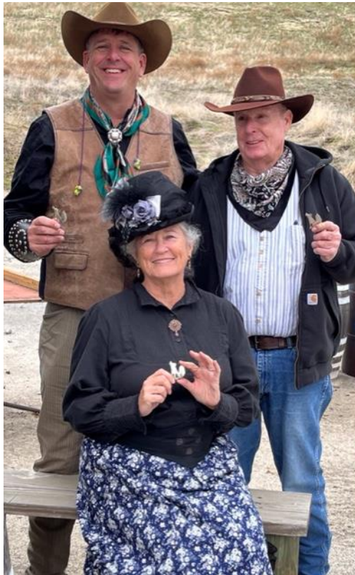
DUTCH LONGHORN, DB HAWKE, LAP DOG