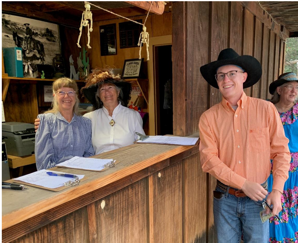
Miss Leia Tombstone, Banker; Lap Dog, Sheriff, Lucky Lu, Calico Blue