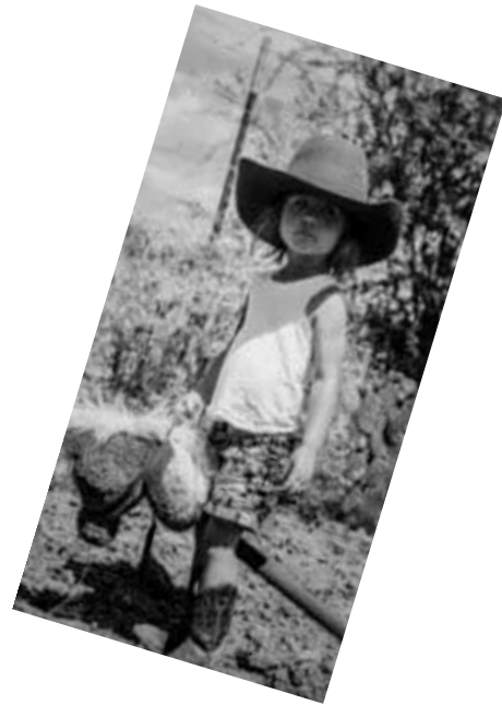
"I'm fixin' to get into trouble...you comin' to She-Bang?"