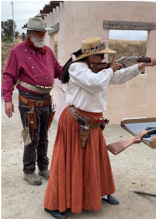
Sherriff Lap Dog gettin' it done