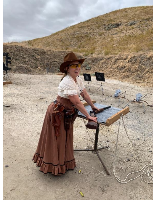
Sassy Grandma's 1 st Match!