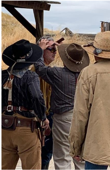
First Aid for Buddy Love