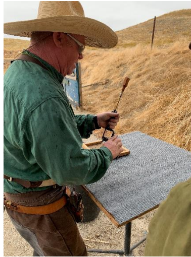
Panhandle Red makes repairs