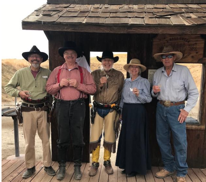
Montego, Professor Cubby Bear, Utah Blaine, Leia Tombstone, Badman Bob