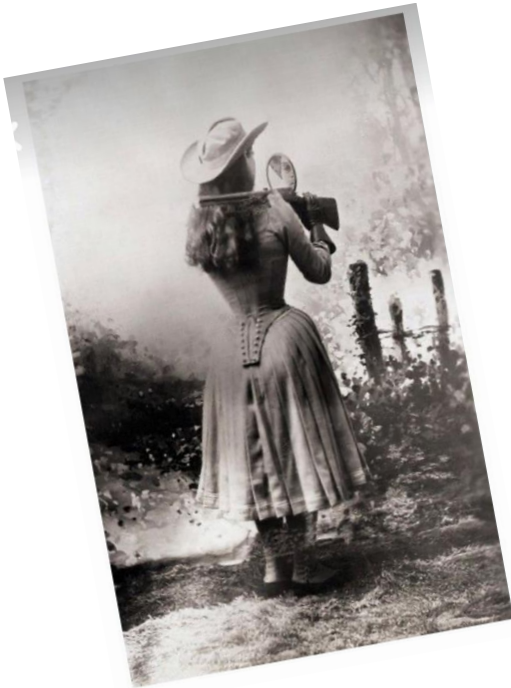
Annie Oakley - All American Girl