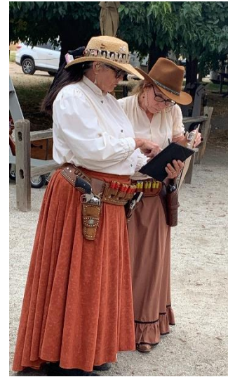
Lap Dog & Sassy Granma check scores.