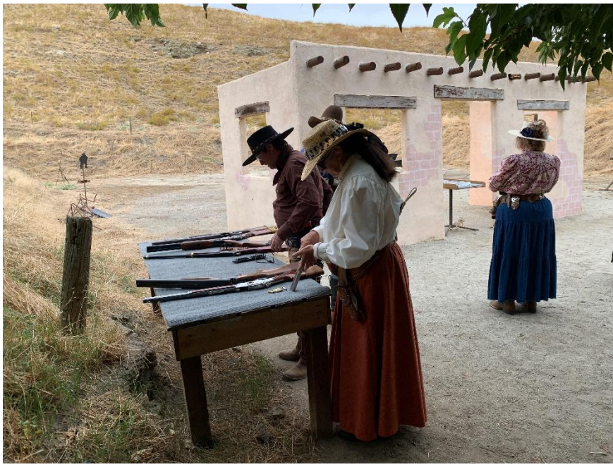
Sheriff Lap Dog & Terra Bella Terror loading up