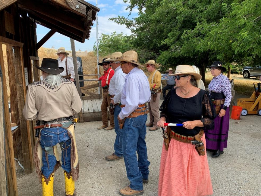
Utah Blaine, Badman Bob, Lap Dog, Chick Ma, Dirty Hands, Bull Mcfearson, Coyote Carson, Gunfighter in a yellow shirt, Professor Cubby Bear on injured reserve