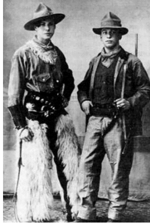
(Thank You Buddy Love)

2023 MATCH CLAENDAR COME AND JOIN US: SEPT 30 & OCT 1 NOVEMBER 4 & 5 DECEMBER 2 & 3