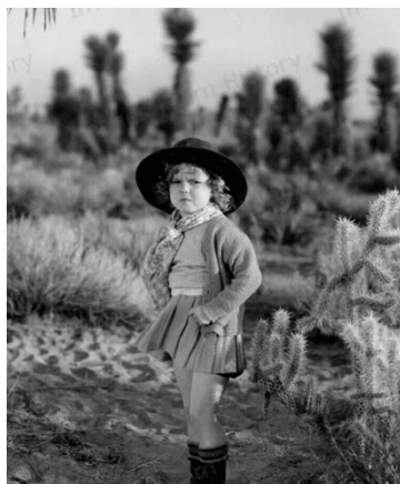
I'm fixin' to go to "She-Bang" ...you comin'?