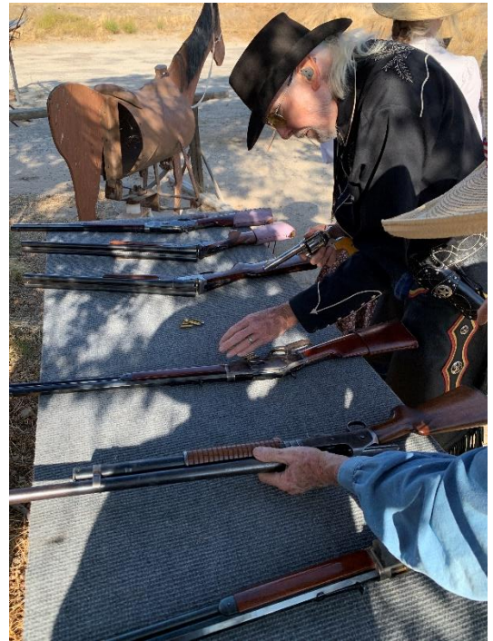
Utah Blaine, Mad Trapper's arm