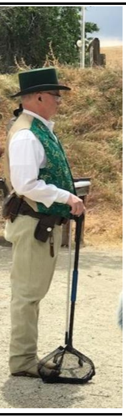
Professor Cubby Bear's Words of Wisdom here soon.