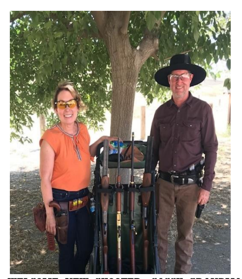
WELCOME NEW SHOOTER: SASSY GRANDMA AND HER ESCORT TERRA BELLA TERROR