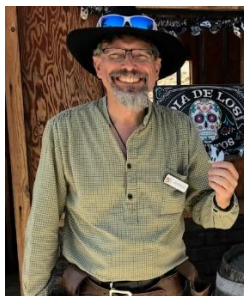
Montego, 5DC Telegraph Operator