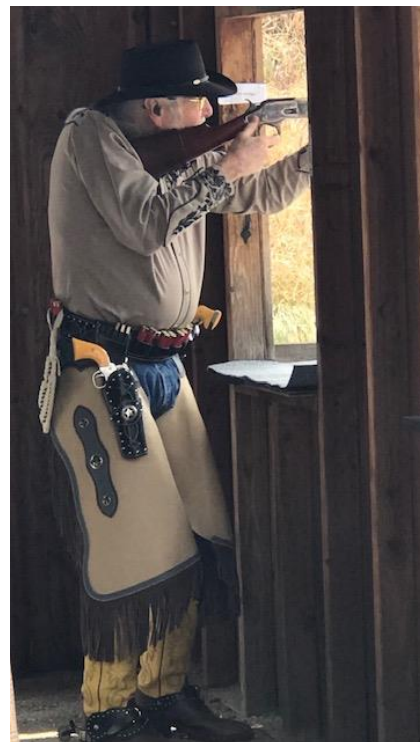
Range Wrangler, Utah Blaine