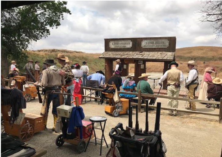
ONE POSSE DAY