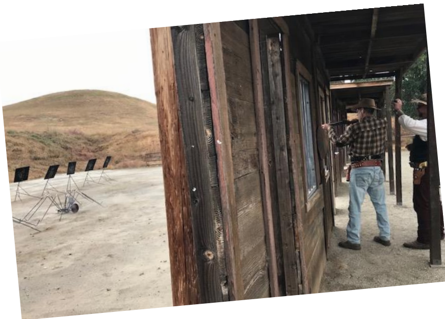
Branding Iron takes out the spider.