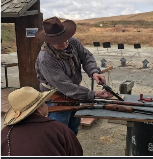
Miss Foxy Schoolmarm keeping the unloading table safe for DB Hawke