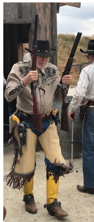
"B-Western" done right.