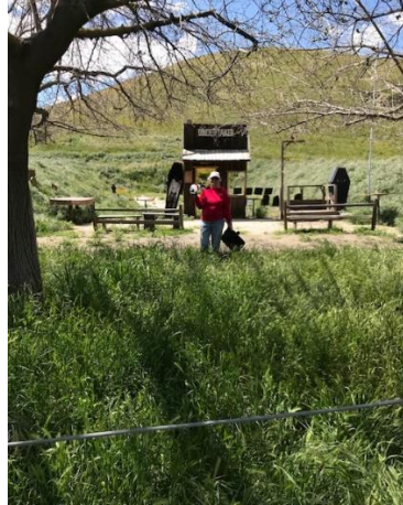
Lap Dog in the knee-high grass