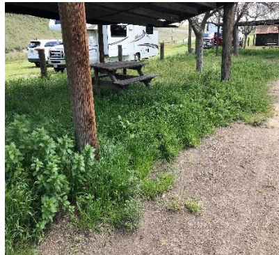
Not quite picnic ready.