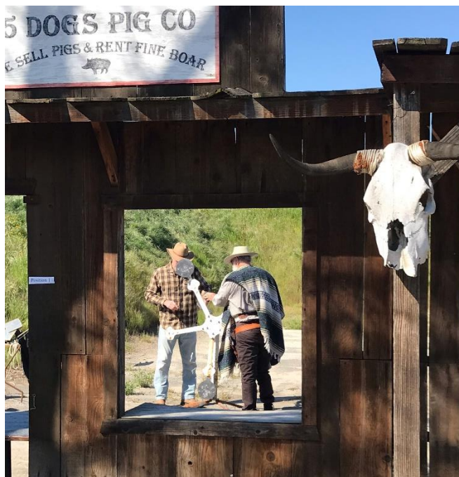
Re-setting The Star