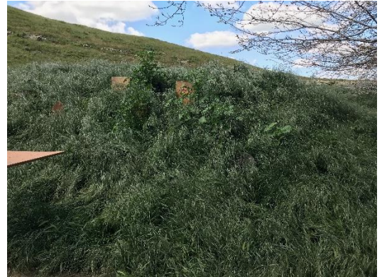
5 Dogs Boot Hill