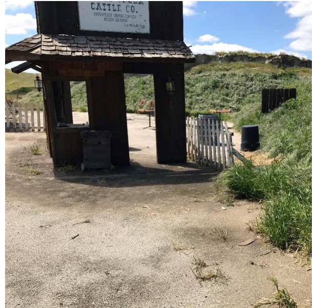
The lovely BAY 1 still needs a Proprietor