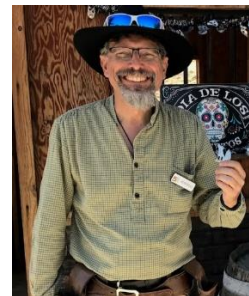
Montego, 5DC Telegraph Operator