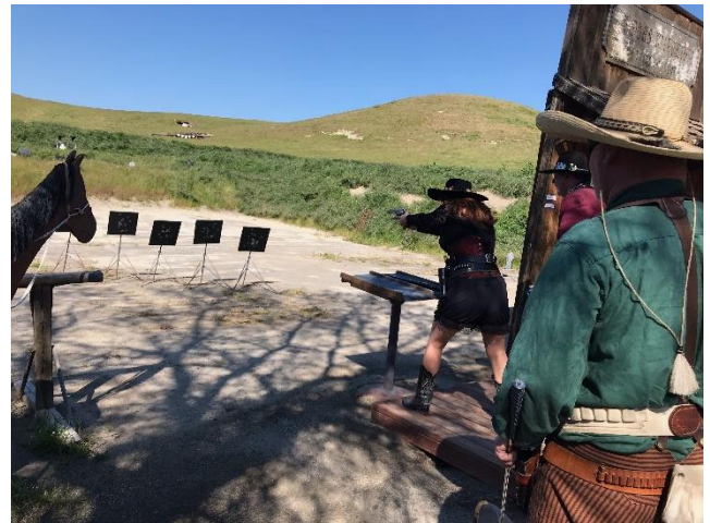
High Dollar, Panhandle Red