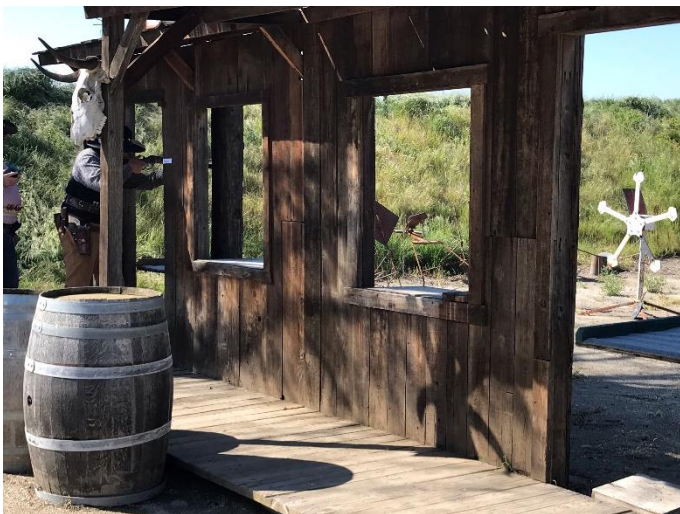
Cowboy vs The Star