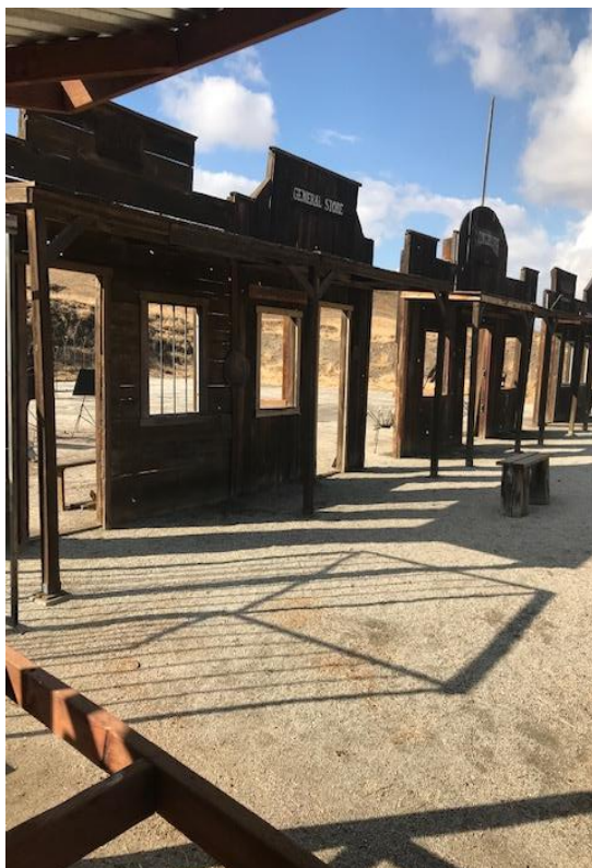
The very spacious BAY 2 needs a Proprietor or two