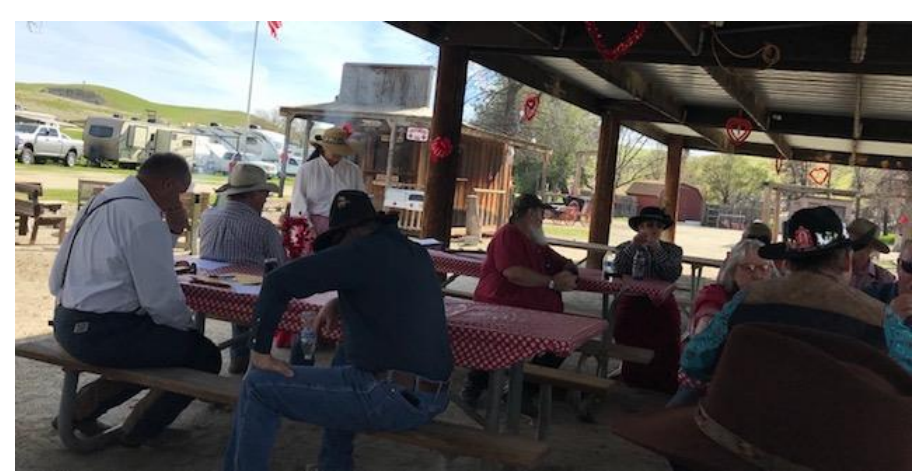
FEBRUARY 5, 2023 Town Council meeting