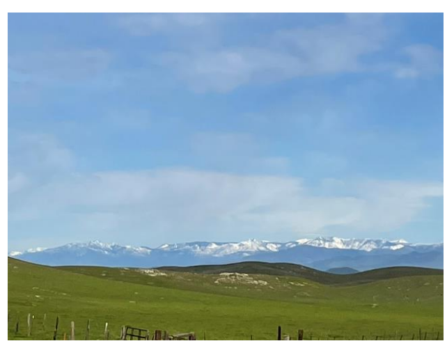
Mountain snow by Utah Blaine