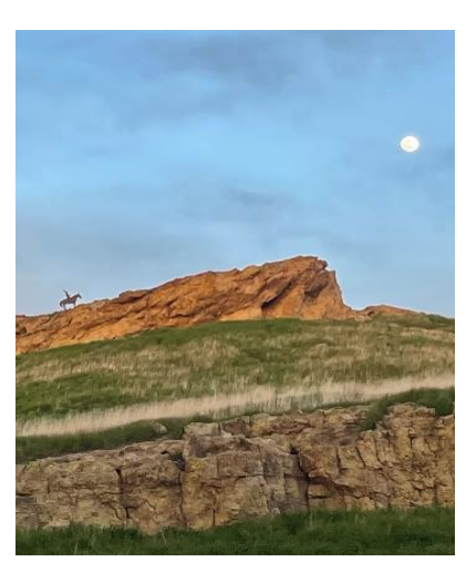
Morning Moon by Utah Blaine