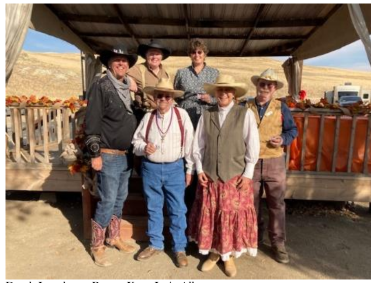
Dutch Longhorn, Bonny Kate, Josie Albuquerque, Tollhouse Tracker, Domino Blaze, Huckleberry Flash