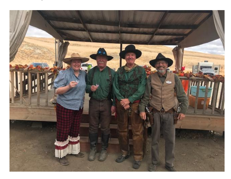
Bonny Kate, Panhandle Red, Coal Train, Montego