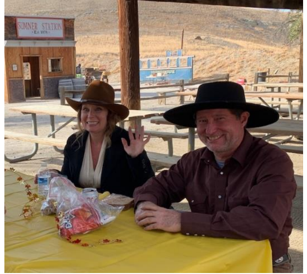
Welcome: Terra Bella Terror & Sassy Grandma