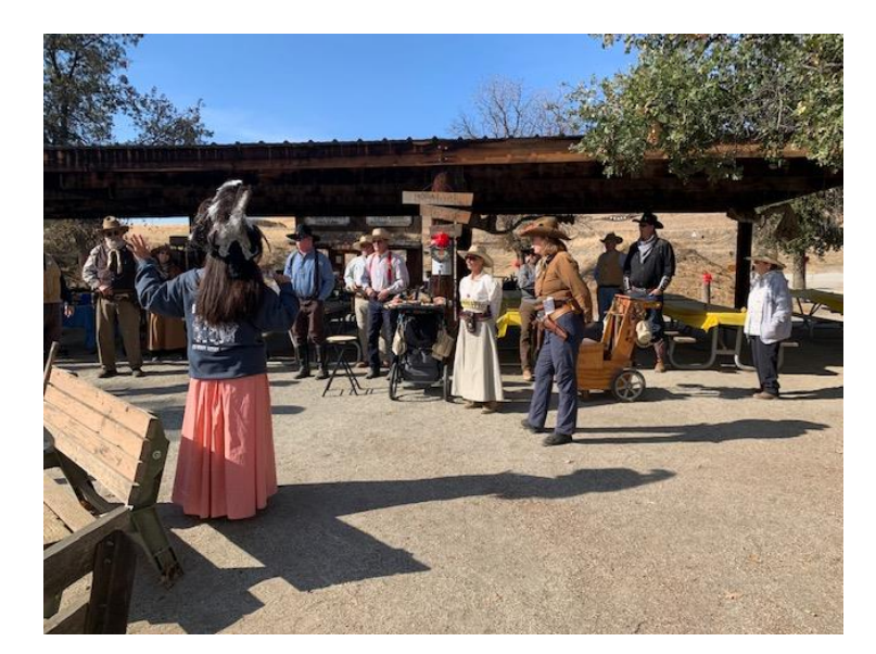
Sherriff Lap Dog's Shooter's meeting

A VERY SPECIAL THANK YOU TO ALL "DOG-NABBITERS"! BECAUSE OF YOUR SUPPORT, IN ADDITION TO POUNDS AND POUNDS OF CANNED GOODS, A CHECK FOR $ 550 WAS PRESENTED TO THE GOLDEN EMPIRE GLEANERS TO HELP FEED NEEDY FAMILIES!