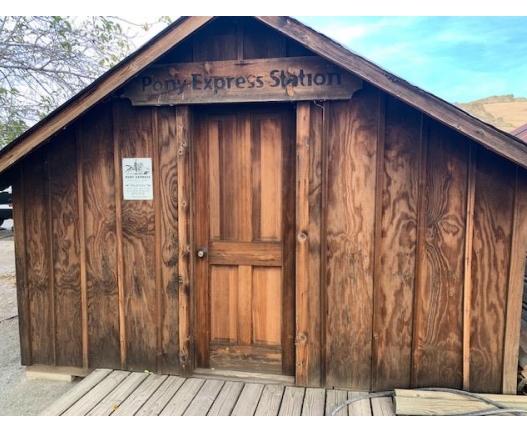
One of the many unique treasures at 5 Dogs