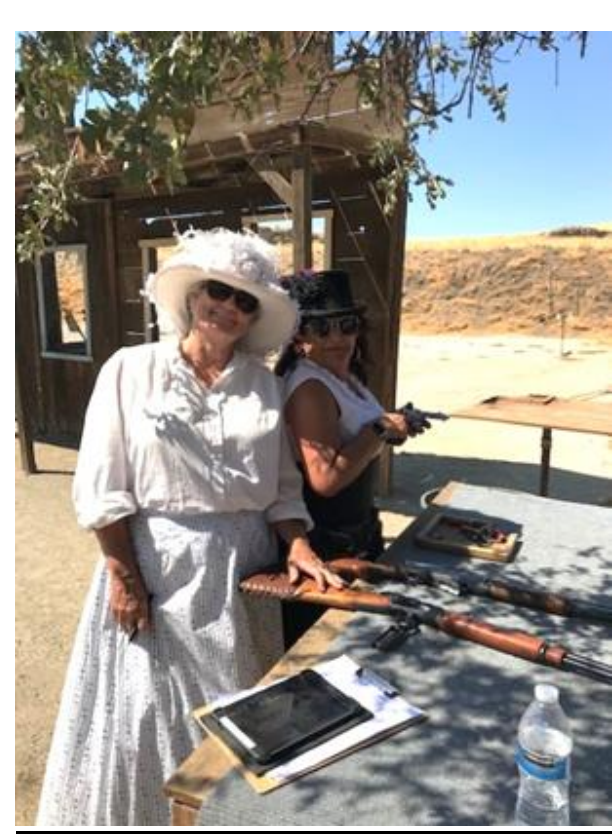
2 Cowboys' Sweethearts