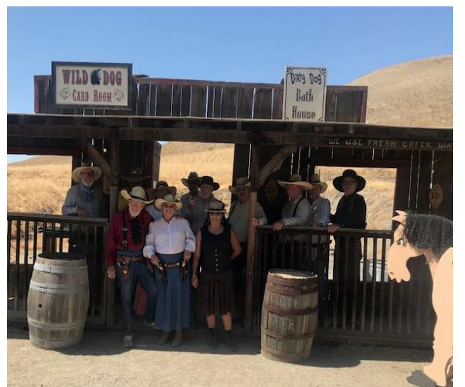
Gunfighter Throwdown Gang