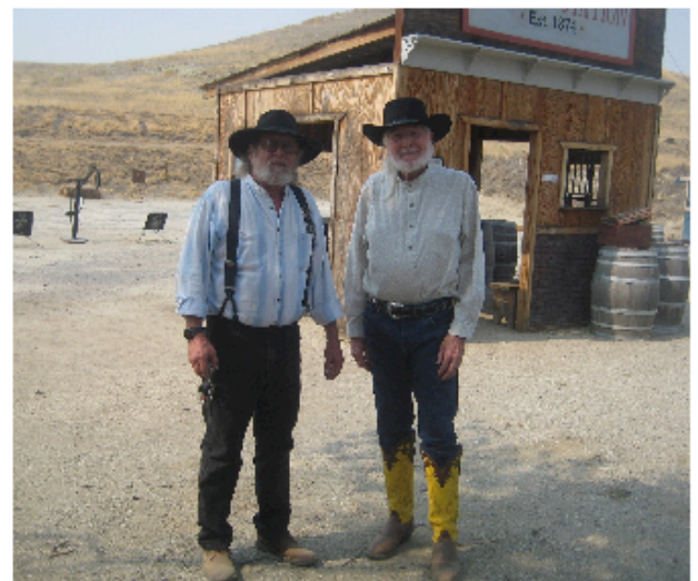
Sunday Clean Shooters Mad Dog Draper Utah Blaine