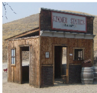
Saturday Clean Shooters