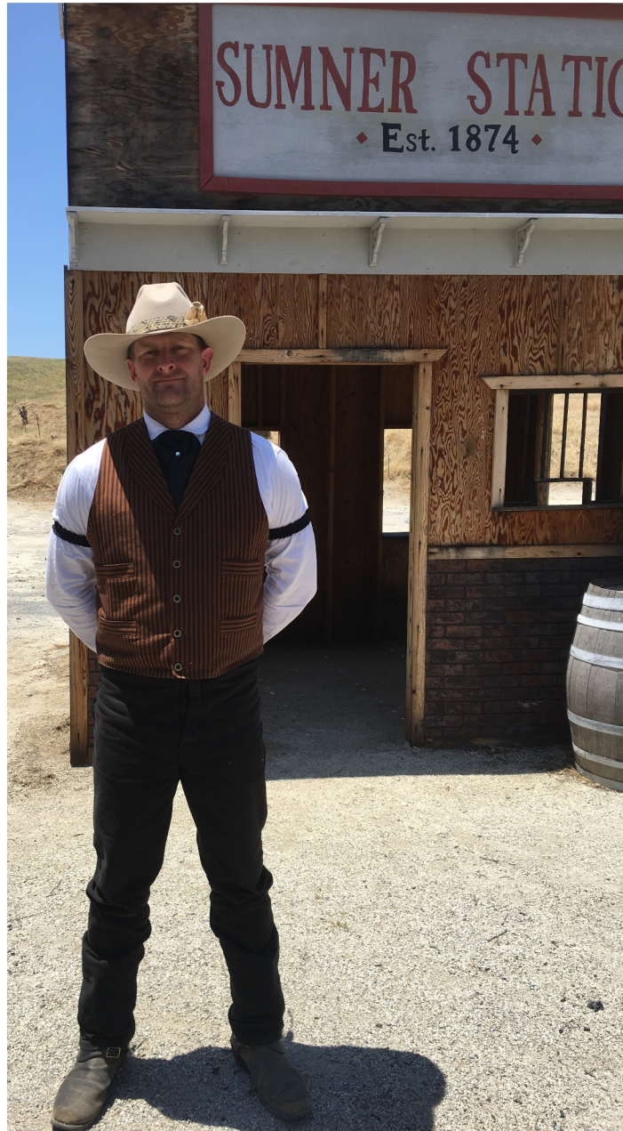
Dirty Dingus McGinnis