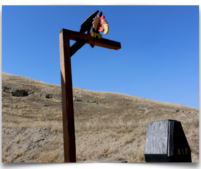
Carrie Carrion waits for the next hanging victim atop the gallows