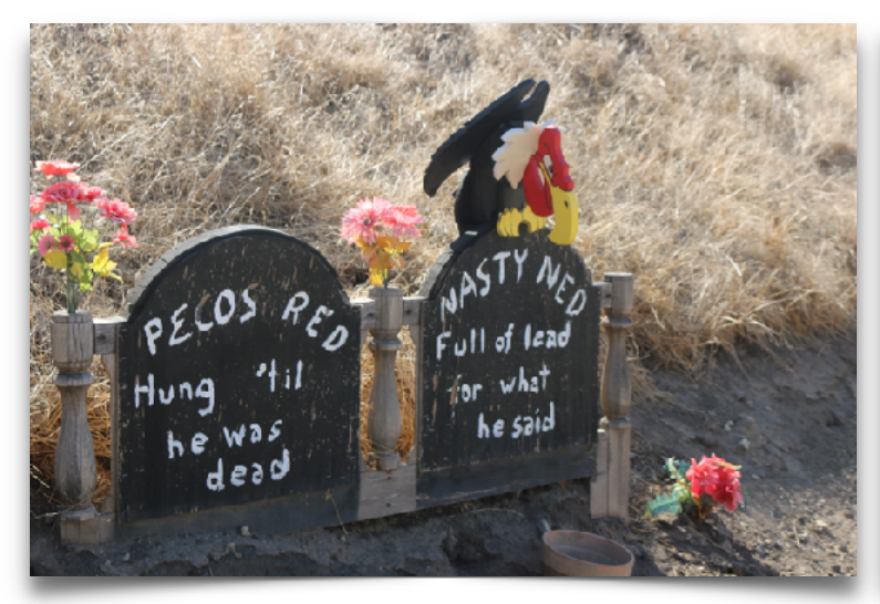
Bloody Beak Bart rests on the gravestone of Nasty Ned