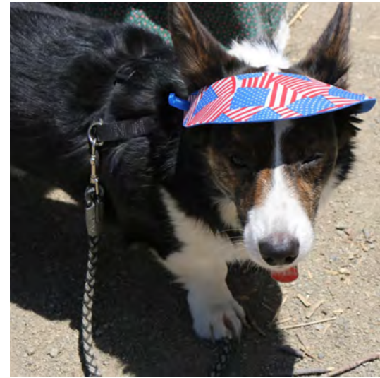
Napoleon One of the 5 Dogs