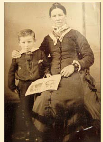
Wyatt & Virginia Earp