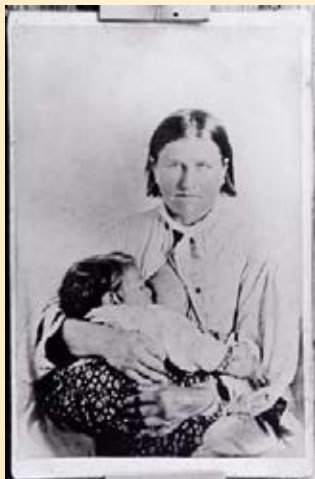
Cynthia Ann Parker