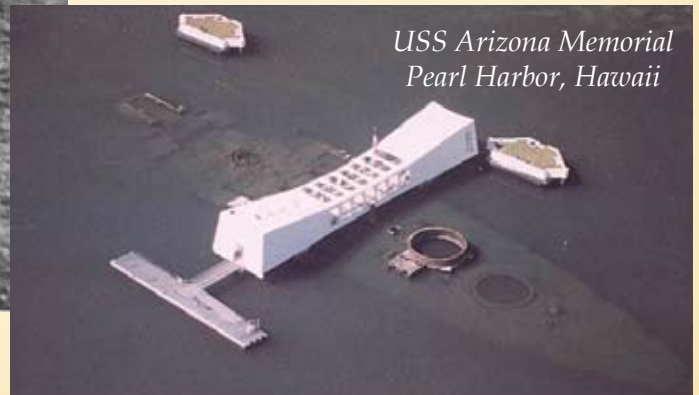
USS Arizona Memorial Pearl Harbor, Hawaii

The Arizona leaving Brooklyn Navy Yard on her shakedown cruise. As completed, the ship had very little superstructure and a small bridge. Rangefinders are visible atop both masts. The mast mounted radio antennae have been lowered for passage under the East River bridges. The Panama Canal and the height of the East River bridges set the size limitations for United States battleships through the WW II era Iowa class.