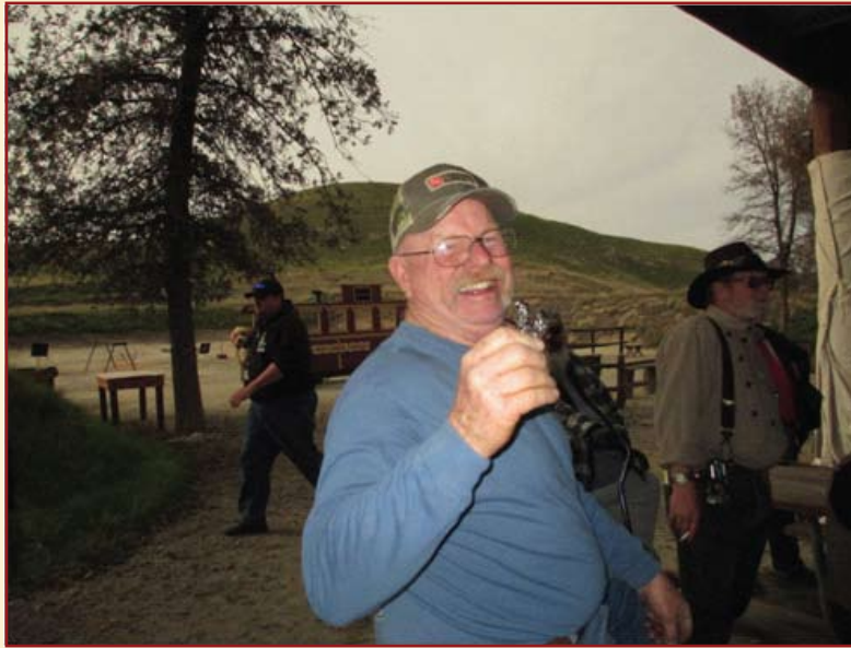
Huckleberry Flash, the only clean shooter on Saturday