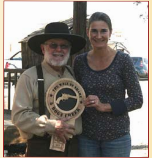
Wall of Shame gets new inductee ... (no congratulations for this one!)