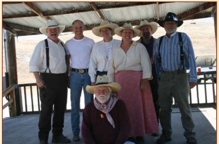
These Magnificent Seven shot clean on Saturday, June 30, 2012.