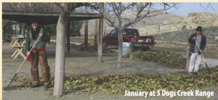
January at 5 Dogs Creek Range

Thursday was the first official day of the Shootout, and it was dedicated to side matches. The proceeds from the side matches went to support construction of the Cowboy Memorial Chapel at Founder's Ranch. There were also four warm-up stages for those wanting to make sure their guns, and their shooting skills, are in best condition before the main match. After the range closed, the Howling Wolf Saloon opened for business. The Saloon is the beating heart of this event but there are many other "organs" that work hard to keep it thriving. I admire, and give my thanks, to all that were involved. After dinner came the true high point of the day, for me, at least: the homemade pie contest. To be a judge at this contest is one of the most coveted functions. The main requirements are: to not be a diabetic; and to be a territorial governor. Luckily, there were enough slices of pie for all to taste, after the winners were decided. As the slices of pie were disappearing, the movie night started and we all settled in to watch a medley of Old Western TV shows. This was especially educational for me because, having been raised in Romania, I knew nothing about them. Now I do and my husband is learning that, when I say, "Kemosabe, I take clothes to river, make more white" it means I'll do the laundry and he needs to give me his whites. ■